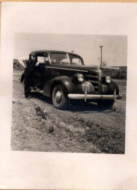
MAY 2ND 1944 - TOM - TAKEN AT BOARDMAN'S HOUSE CORNWALL, ONT