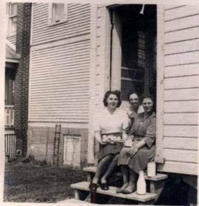
AT BOARDMAN'S. CORNWALL, ONTARIO THE NEXT DAY ARRIVED AT TROQUOIS, ONT.