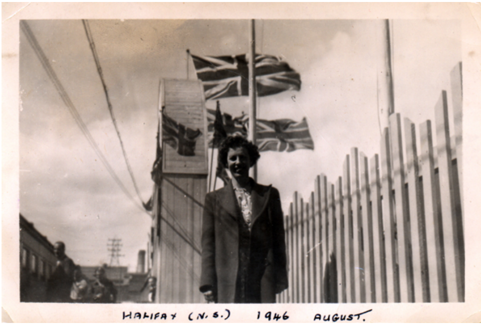
HALIFAX (N.S.) 1946 AUGUST.